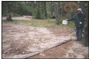
Hemlock Drive Before