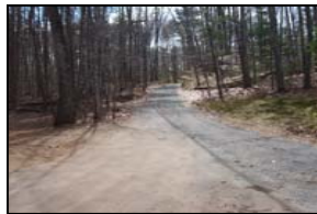
Hemlock Drive After

Enormous strides have begun to take place to protect the water quality of Square Pond but we are not out of the woods yet. This is your watershed & we need your help to protect it.